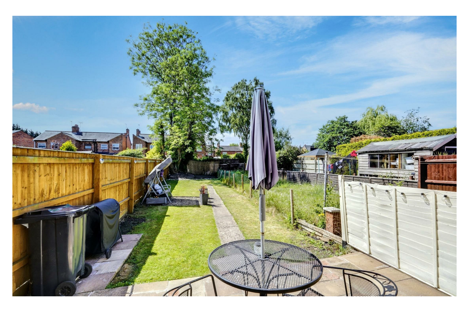
THIS IS A TWO DOUBLE BEDROOM MID PROPERTY PROVIDING A LOVELY HOME WHICH IS SITUATED CLOSE TO THE CENTRE OF KEGWORTH VILLAGE.

Being located on Borrowell, this mid property provides a lovely home which will suit a whole range of buyers, from those buying their first property to someone who might be downsizing and looking for a property which is easy to maintain and close to local amenities and facilities. For the size and layout of the accommodation and privacy of the rear garden to be appreciated, we recommend that interested parties do take a full inspection so they can see all that is included in this lovely two bedroom home for themselves.