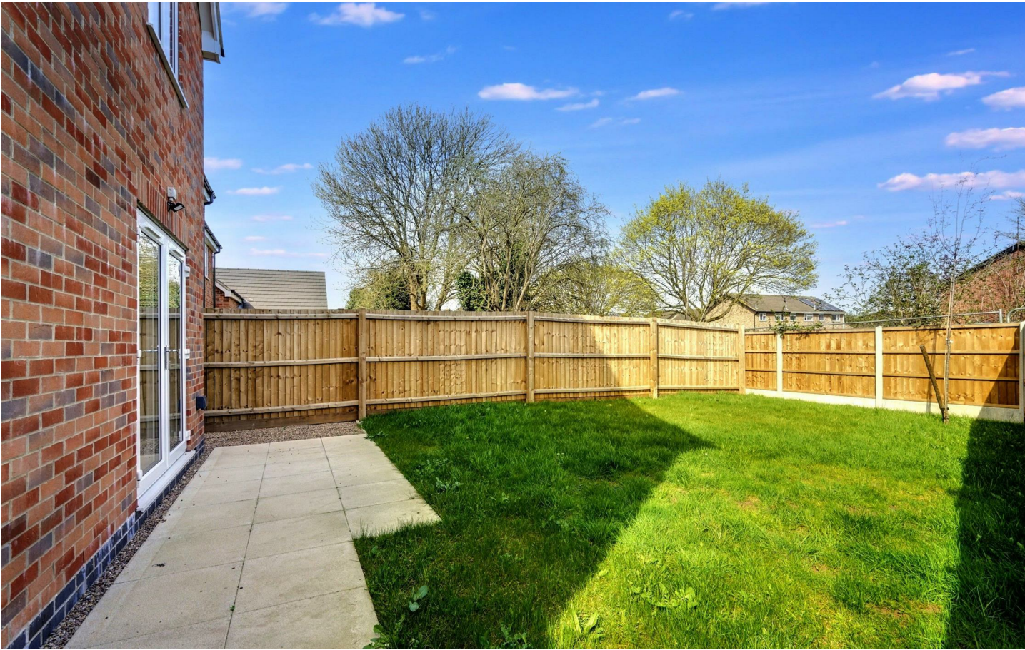
A DOUBLE FRONTED THREE BEDROOM DETACHED FAMILY HOME, THE MASTER BEDROOM HAVING AN EN-SUITE AND OFF ROAD PARKING WITH EV CHARGING POINT

PART EXCHANGE AVAILABLE - Being constructed of an attractive facia brick under a pitched tiled roof and being highly appointed throughout, this large three bedroom detached home includes a reception hall, from which stairs take you to the first floor and doors lead to the through lounge which has windows to the front and side and the exclusively fitted and equipped living/dining kitchen which will have high quality kitchen units and appliances and from the dining area there will be double opening, double glazed French doors leading to the garden. There is also a ground floor w.c. and to the first floor the landing will lead to the three good size bedrooms, the main bedroom having an en-suite shower room/w.c. and the family bathroom will include a mains flow shower over the bath. Outside there are good size gardens which will be lawned with fencing to the boundaries and off road parking is provided for two vehicles.