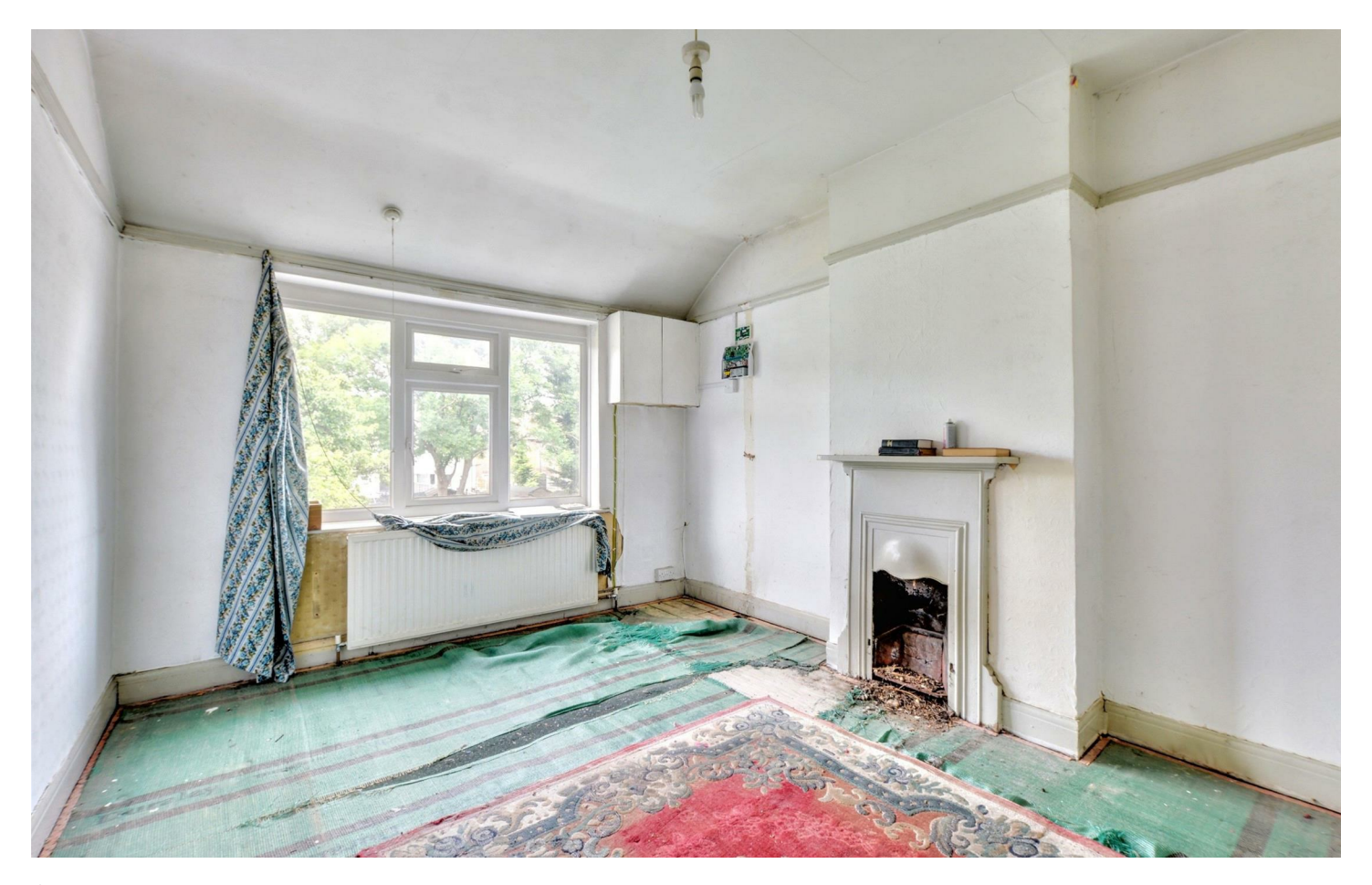
A three-bedroom semi-detached house offering great potential.

Requiring full renovation this traditionally styled and constructed three bedroom house, is an excellent opportunity for the incoming purchaser to upgrade and remodel and their taste and requirements.