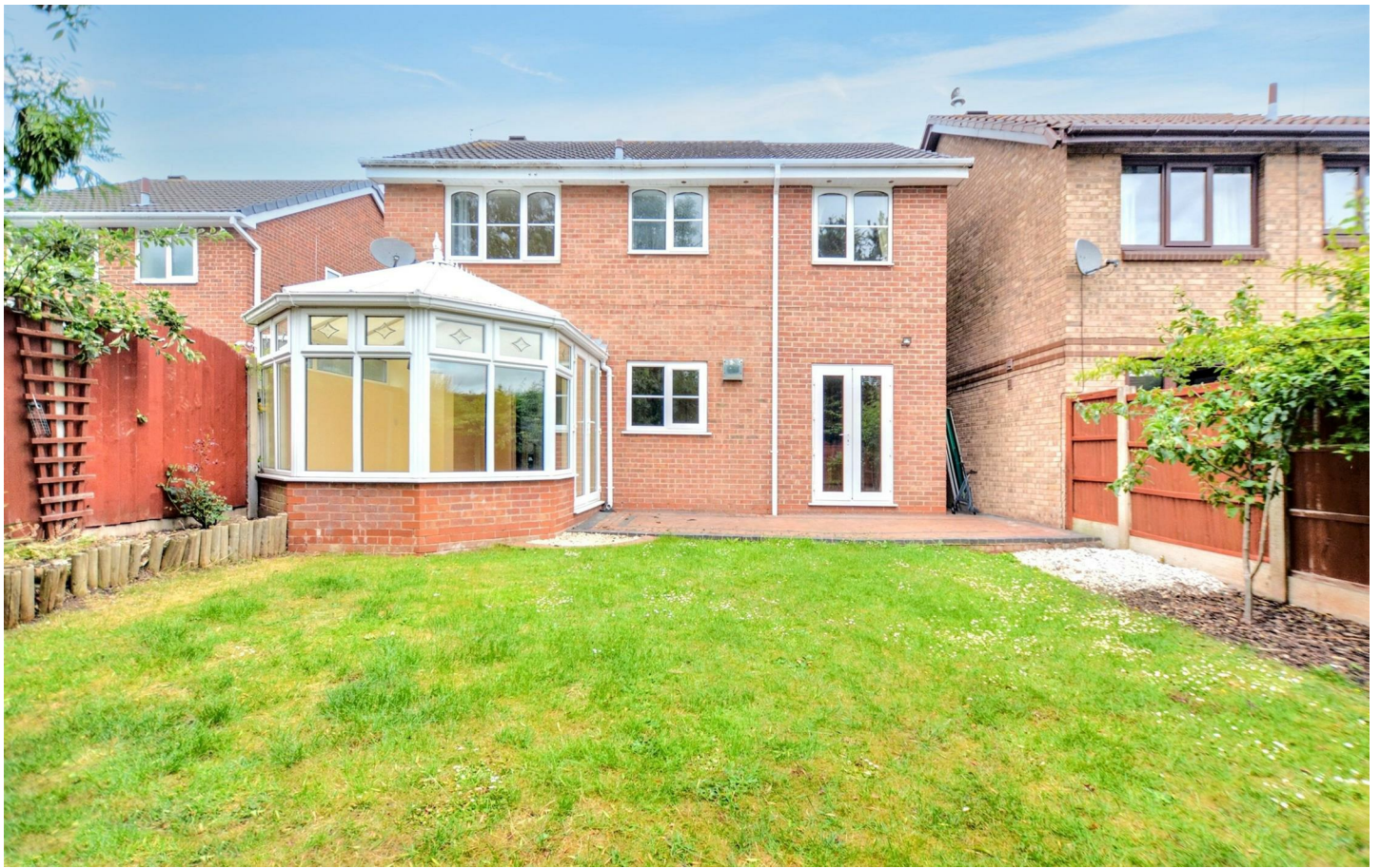
A FIVE BEDROOM DETACHED HOME IN TOTON OFFERING NO ONWARD CHAIN.

Robert Ellis are delighted to offer to the market this detached home situated on Epsom Road, a most sought road within Toton. This spacious and well presented five bedroom detached home offers the perfect blend of comfort, convenience, and kerb appeal. With no onward chain, this is an exceptional opportunity for families looking to upsize or professionals seeking a well-connected home in a desirable setting. From the moment you arrive, the property impresses with its generous off-road parking, integral garage, and smart exterior. Step inside to discover a thoughtfully designed interior, well maintained throughout and ready for immediate occupation. The versatile layout provides ample space for family life, entertaining, or working from home, with five well-proportioned bedrooms offering flexibility for guests, hobbies, or growing teens with ample living space to the ground floor. Located within easy reach of excellent local schools, shops, and essential amenities, this home also benefits from superb transport links, including direct access to the A52 and close proximity to the Nottingham tram network — making commuting a breeze.