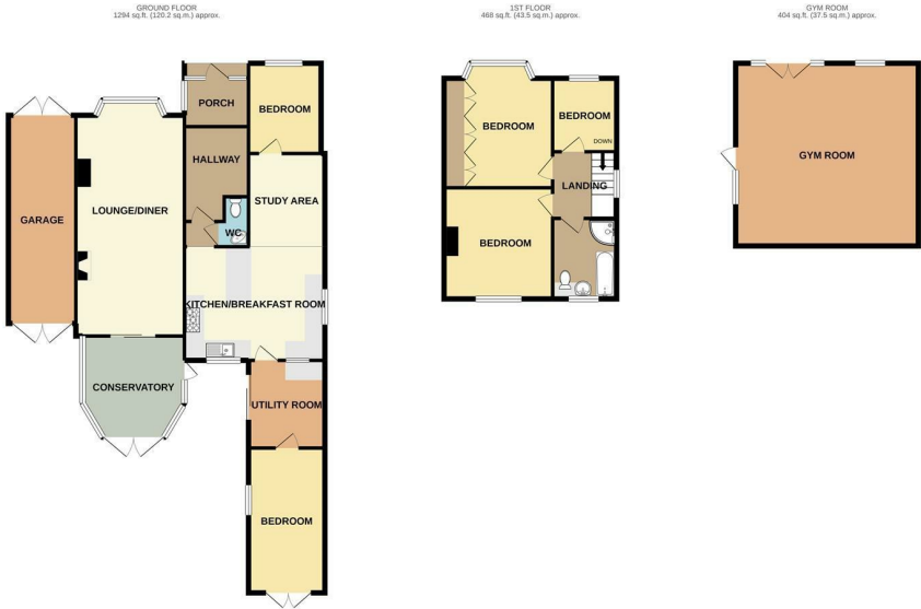
TOTAL FLOOR AREA : 2166 sq ft (201.2 sq.m.) approx. Whilst every attempt has been made to ensure the accuracy of the floorplans contained here, measurements of doors, windows, rooms and any other items are approximate and no responsibility is taken for any error, omission or mis-statement. This plan is for illustrative purposes only and should be used as such by any prospective purchaser. The services, systems and appliances shown have not been tested and no guarantee as to their operability or efficiency can be given. Made with Metreapp ©2020