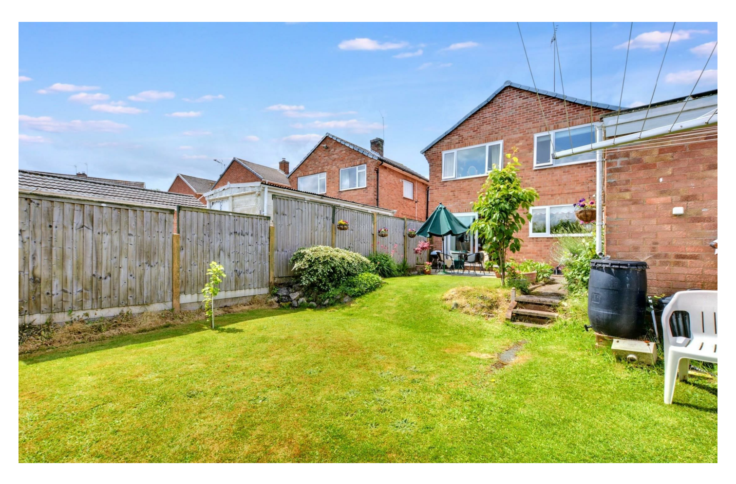
A WELL PRESENTED AND SPACIOUS, THREE BEDROOM DETACHED HOUSE WITH OFF STREET PARKING, BRICK BUILT GARAGE AND ENCLOSED REAR GARDEN OVERLOOKING ALLOTMENTS AND FIELDS, PERFECT FOR A WIDE RANGE OF BUYERS.

Robert Ellis are pleased to bring to the market this fantastic example of a three bedroom detached house with off street parking and rear garden, perfect for a wide range of buyers from first time buyers to families. The property is constructed of brick to the external elevations and benefits double glazing and gas central heating throughout. An internal viewing is highly recommended to appreciate the property and location on offer.