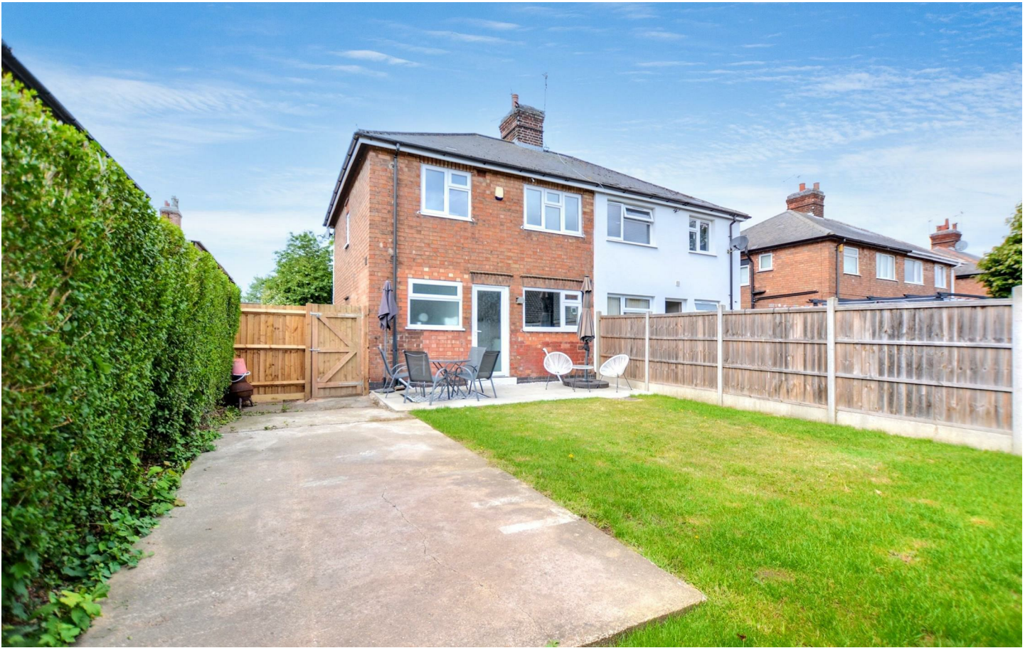
A THREE BEDROOM SEMI DETACHED HOUSE FOUND WITHIN WALKING DISTANCE OF THE TOWN CENTRE.

Robert Ellis are delighted to offer to the market a fantastic opportunity to purchase this well presented three bedroom semi-detached property located on New Tythe Street. The property is ideal for a first time buyer who is looking to make their first steps onto the property ladder. New Tythe Street is situated in a convenient location, situated just a short distance from local amenities including schools, various supermarkets and Long Eaton train station, making commuting and daily errands effortless. The property boasts off-road parking, central heating, and double glazing throughout, ensuring year round comfort and efficiency. Inside, the home is tastefully decorated and ready to move into, offering generous living space for couples, young families, or professionals. Viewing is highly recommended to fully appreciate all that this fantastic property has to offer.