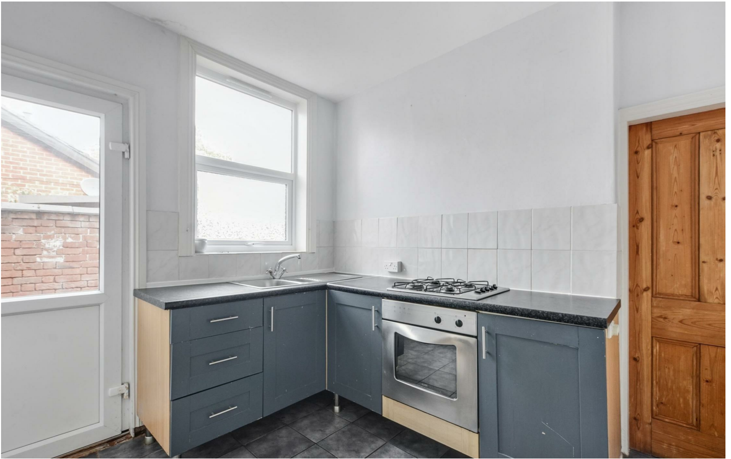
A three bedroom semi detached Victorian Villa.

This instantly attractive bay front property comes to the market with NO UPWARD CHAIN and has been modernised in recent times.