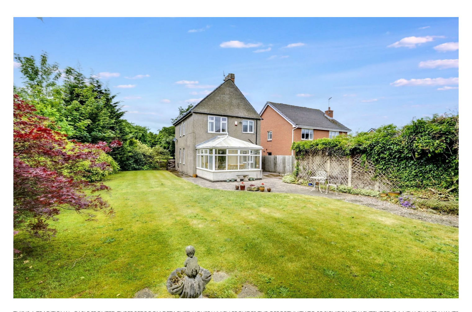
THIS IS A TRADITIONAL, GABLE FRONTED THREE BEDROOM DETACHED HOUSE WHICH PROVIDES THE OPPORTUNITY TO BE SIGNIFICANTLY EXTENDED IF A NEW OWNER WANTS TO CREATE A LARGER PROPERTY.

Being located on High Road in the middle of Toon, this traditional property, which was originally built in the 1920's, offers a lovely family home with the potential to alter the internal layout to the existing property or significantly extend to the sides and rear. The property is being sold with the benefit of NO UWPARD CHAIN and for the size and layout of the existing accommodation and privacy of the gardens to be appreciated, we recommend that interested parties do take a full inspection so they can see all that is included in this lovely property for themselves. The property is well placed for easy access to the well regarded local schools provided by Toton as well as many other amenities and facilities including excellent transport links, all of which have helped to make this a very popular and convenient place to live.