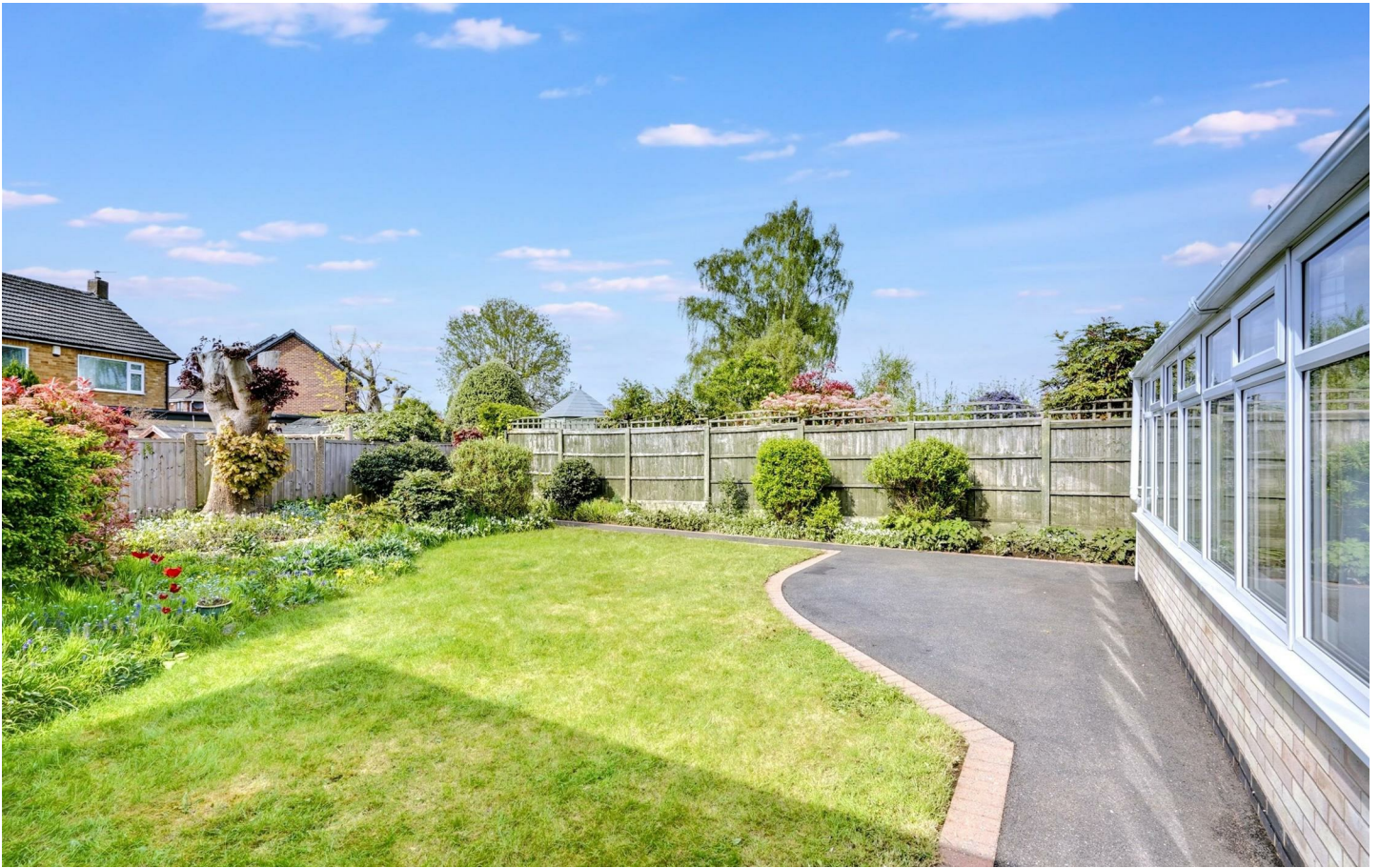
THIS IS A SPACIOUS THREE BEDROOM DETACHED BUNGALOW POSITIONED ON A LARGE PLOT WITH WELL ESTABLISHED GARDENS TO THE FRONT AND REAR.

Robert Ellis are pleased to be instructed to market this spacious three bedroom detached bungalow which is being sold with the benefit of NO UPWARD CHAIN and is ready for immediate occupation by a new owner. The property provides light and airy accommodation and for the size and layout of the property and privacy of the rear garden to be appreciated, we recommend that interested parties take a full inspection so they are able to see all that is included in this beautiful home for themselves. The property is well placed for easy access to all the shopping facilities provided in Beeston as well as at the Chilwell Retail Parks and to many other amenities and facilities, all of which have helped to make this a very popular and convenient place to live.