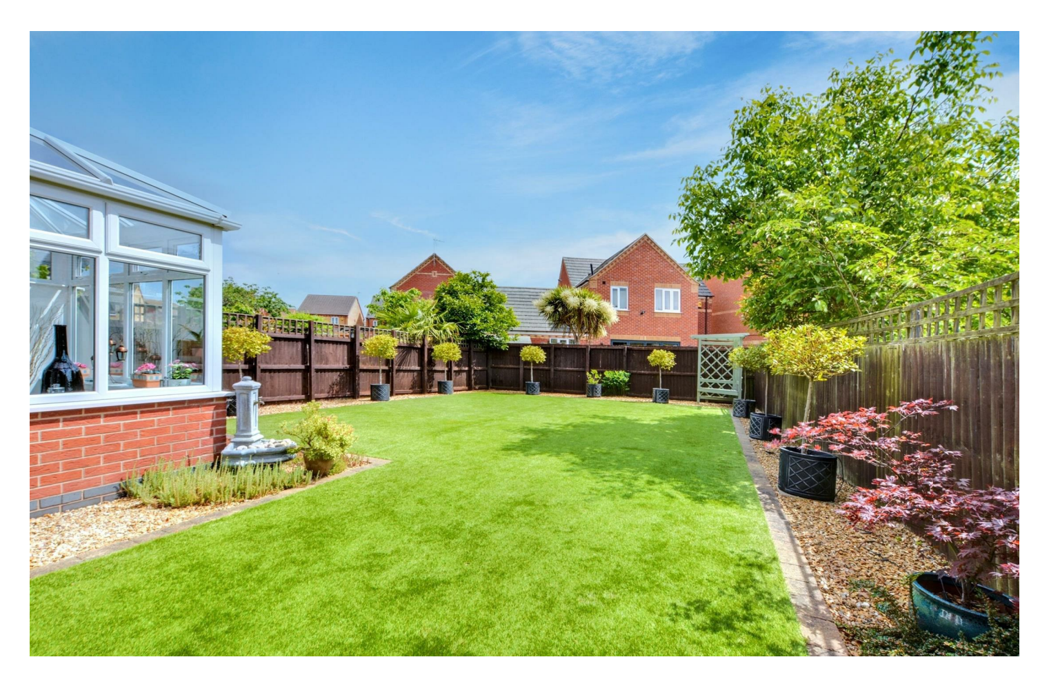
A WELL PRESENTED AND SPACIOUS FOUR BEDROOM DETACHED FAMILY HOME WITH OFF STREET PARKING, BRICK BUILT GARAGE AND ENCLOSED, LOW MAINTENANCE REAR GARDEN, BEING SOLD WITH THE BENEFIT OF NO ONWARD CHAIN.

Robert Ellis are delighted to be instructed to bring to the market this superb example of a four bedroom detached family home. The property is constructed of brick to the external elevations and benefits double glazing and gas central heating throughout. This would be an ideal family home and is being sold with the benefit of no onward chain. An internal viewing is highly recommended to appreciate the property and location on offer.