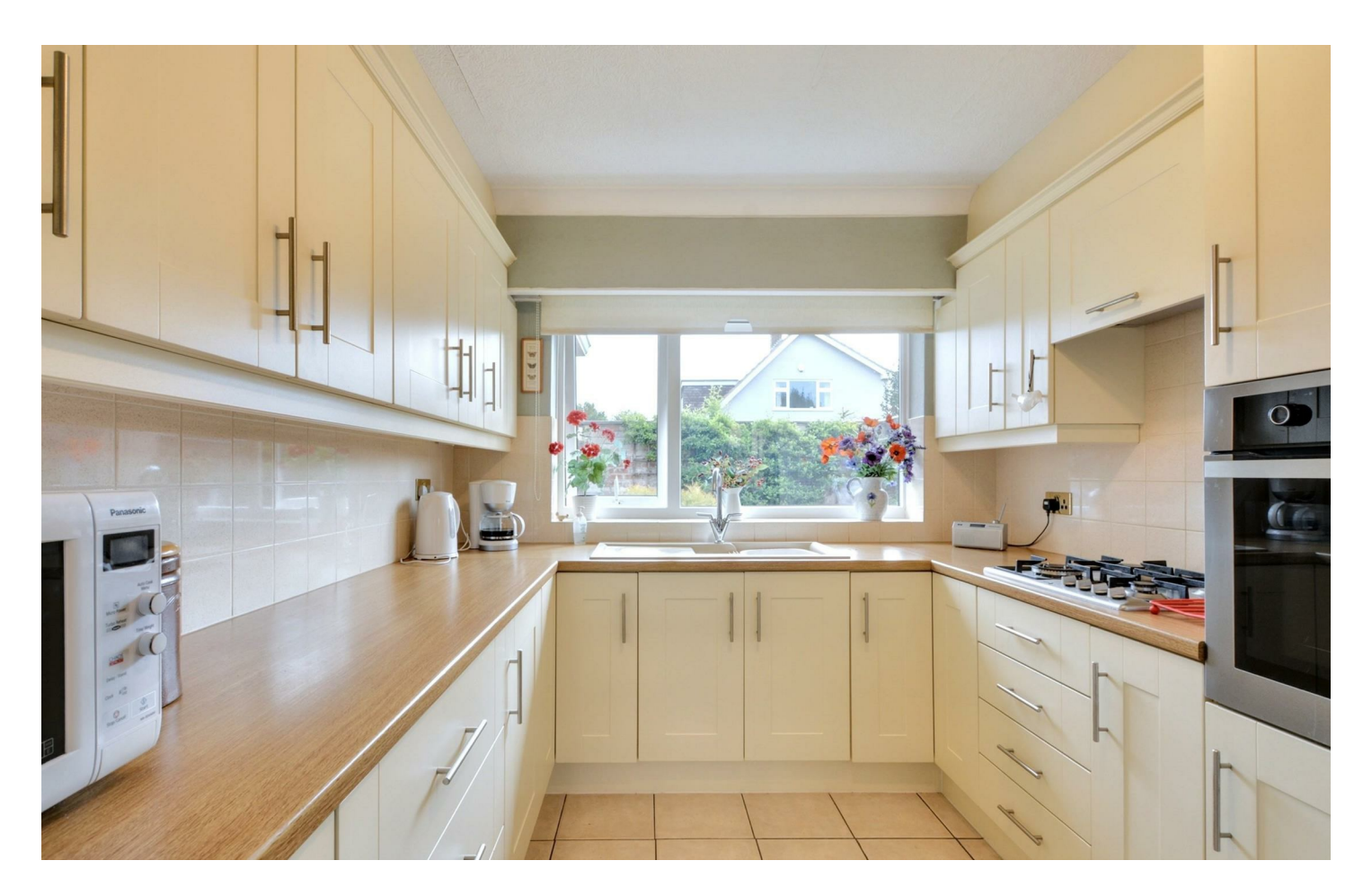
THIS SEMI-DETACHED CHALET BUNGALOW PROVIDES VERSATILE LIVING AND BEDROOM ACCOMMODATION AND IS POSITIONED AT THE HEAD OF A QUIET CRESCENT IN THE HEART OF THE VILLAGE BEING SOLD WITH NO UPWARD CHAIN!

Being located on Belmont Avenue, this semi-detached property offers an immaculately presented home with two bedrooms to the first floor. For the size of the accommodation and privacy of the side garden to be appreciated, we recommend that interested parties do take a full inspection so they can see all that is included in this lovely home for themselves. Breaston is a very popular award winning village which has a number of local amenities and facilities and is also close to excellent transport links, all of which have helped to make this a very popular and convenient place to live.