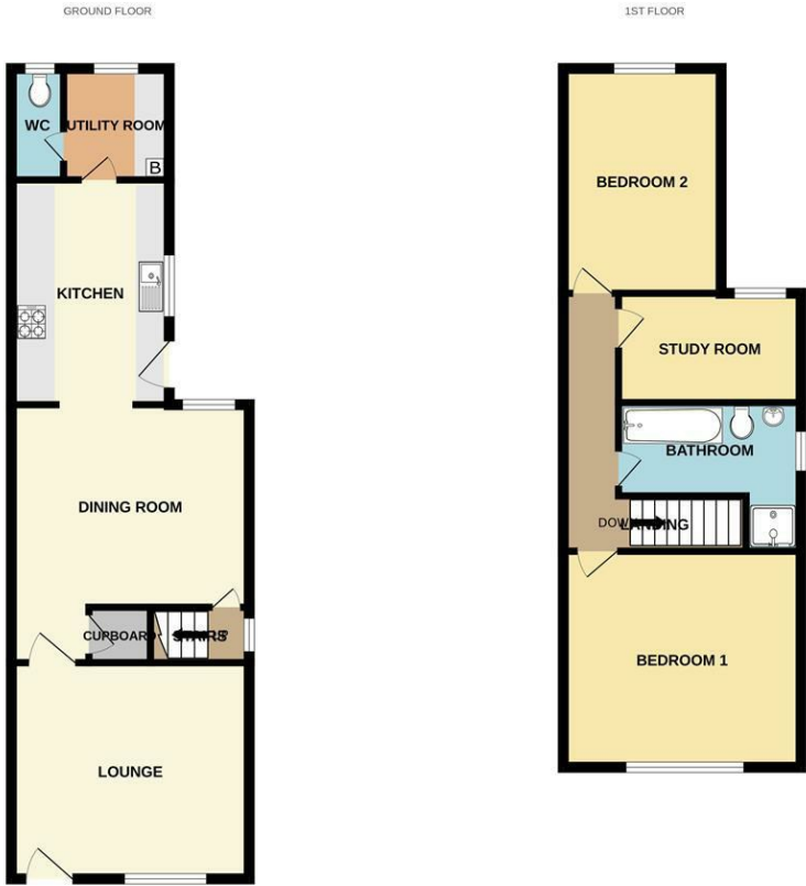
64 WILLIAM STREET, LONG EATON

Whilst every attempt has been made to ensure the accuracy of the floorplan contained here, measurements of doors, windows, rooms and any other items are approximate and no responsibility is taken for any error, omission or misstatement. This plan is for illustrative purposes only and should be used as such by any prospective purchaser. The services, systems and appliances shown have not been tested and no guarantee as to their operability or efficiency can be given. Made with Metropix ©2025