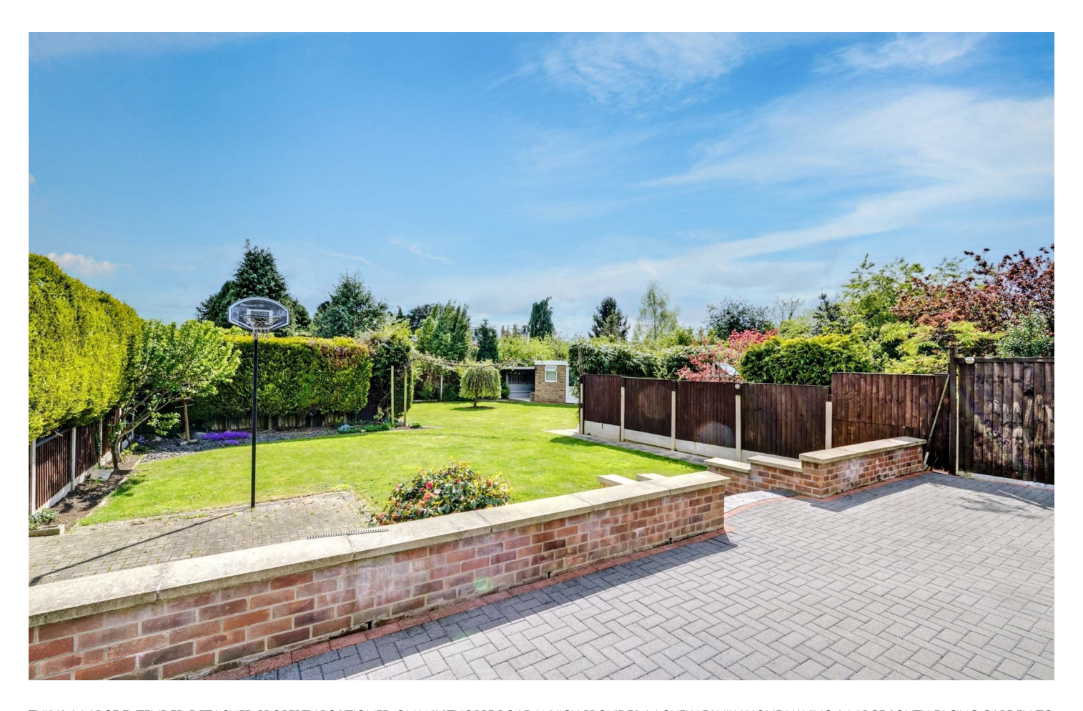
THIS IS A LARGE EXTENDED DETACHED PROPERTY POSITIONED ON WILSTHORPE ROAD WHICH PROVIDES A LOVELY FAMILY HOME HAVING A LARGE SOUTH FACING GARDEN TO THE REAR

Robert Ellis are very pleased to be asked to market this substantial detached property which provides extremely large ground floor living accommodation and four bedrooms to the first floor which could easily be altered to make it a five bedroom home. The property benefits from having solar panels to the roof which provides a tariff payment in the region of £2,000 p.a. which means the utility running costs of the property are reduced to somewhere in the region of £125 a month. As people will see from the sales literature the house has an EPC rating of B and therefore is an extremely economical and efficient large family house to run. It would be difficult for interested parties to be able to appreciate the actual size of the accommodation included and the privacy and size of the garden at the rear by just taking a casual look at the front elevation so we strongly recommend they take a full inspection so they can see all that is included in this large family home for themselves. The property is being sold with the benefit of no upward chain and it is therefore ready to move into by a prospective purchaser. Breaston is a very popular village located between Nottingham and Derby which has a number of local amenities and facilities and excellent access to transport links, all of which have helped to make this a very popular and convenient place in which to live.