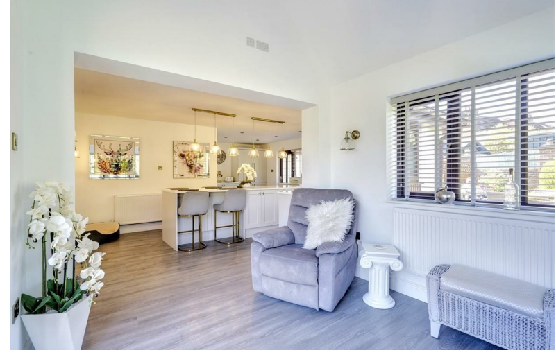
The Grange Smalley, Derbyshire DE7 6JZ