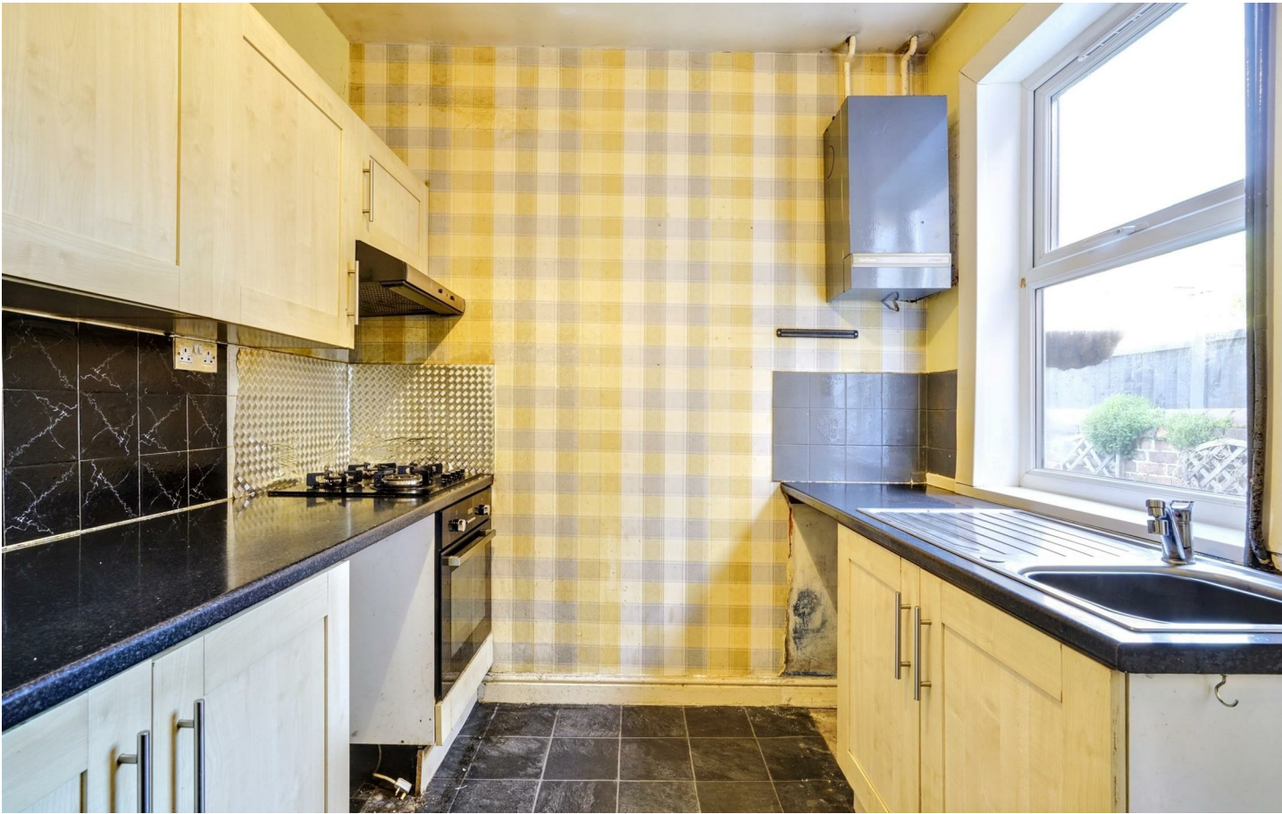
THIS IS A TWO DOUBLE BEDROOM VICTORIAN SEMI DETACHED HOUSE WHICH WOULD NOW BENEFIT FROM A REFURBISHMENT AND UPGRADE PROGRAMME.

Being located on Hamilton Road, this two bedroom property will appeal to a builder or investor type buyer who is looking for a property on which they can stamp their own mark. We do not feel this property is suitable for a first time buyer and therefore we are looking for a prospective purchaser who understands the work required to the property to bring it up to the right condition to be able to live in or rent out. For the size and condition of the property and privacy of the rear garden to be appreciated, we recommend that interested parties take a full inspection so they can see the whole property for themselves. The property is well placed for easy access to Long Eaton town centre and to the other amenities and facilities provided by the surrounding area.