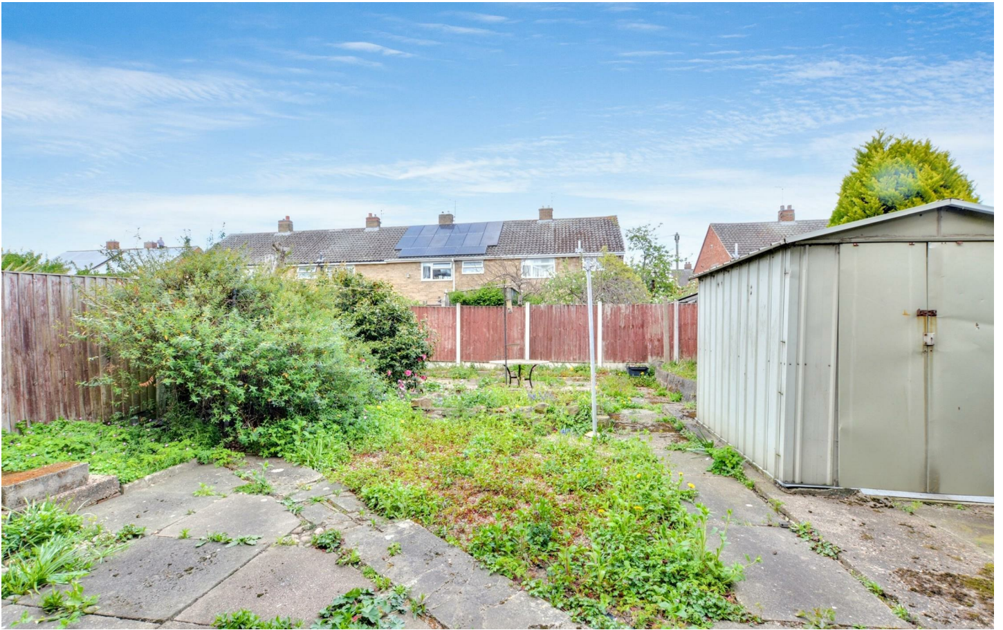
A SPACIOUS TWO DOUBLE BEDROOM, SEMI DETACHED HOUSE WITH OFF STREET PARKING, LEAN TO AND ENCLOSED LOW MAINTENANCE REAR GARDEN, BEING SOLD WITH THE BENEFIT OF NO ONWARD CHAIN.

Robert Ellis are pleased to be instructed to market this superb example of a two double bedroom, semi-detached house with off street parking for several vehicles. The property is constructed of brick to the external elevations and benefits double glazing and gas central heating throughout. This would be an ideal property for a wide range of buyers and an internal viewing is highly recommended to appreciate the property and location on offer.