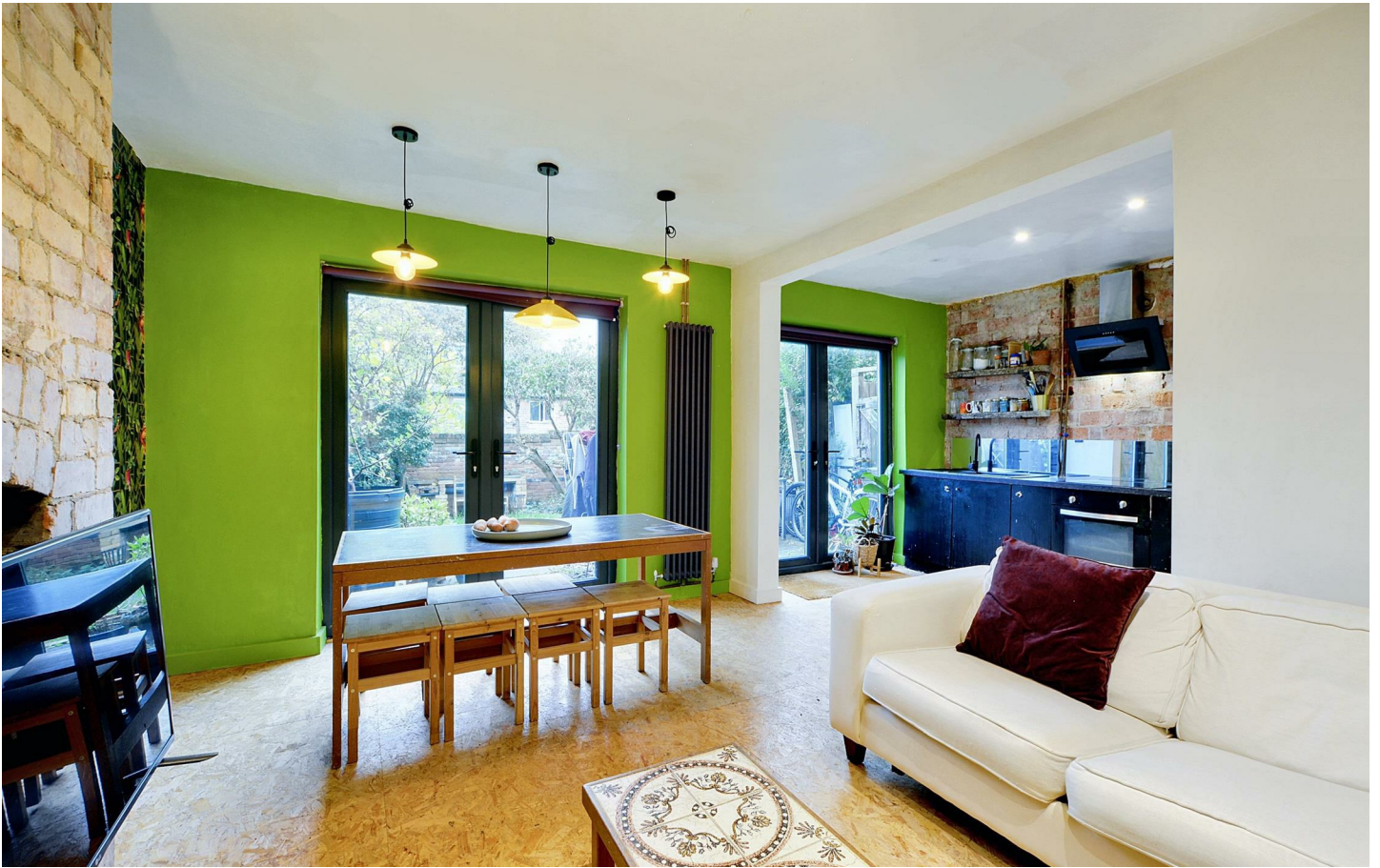
A spacious three bedroom bay fronted semi-detached house.

Situated in this popular and convenient residential location, readily accessible for a range of local shops and amenities including transport links, The University of Nottingham, Queens Medical Centre and Nottingham City Centre, this fantastic property is considered an ideal opportunity for a variety of potential purchasers including first time buyers, young professionals and investors.