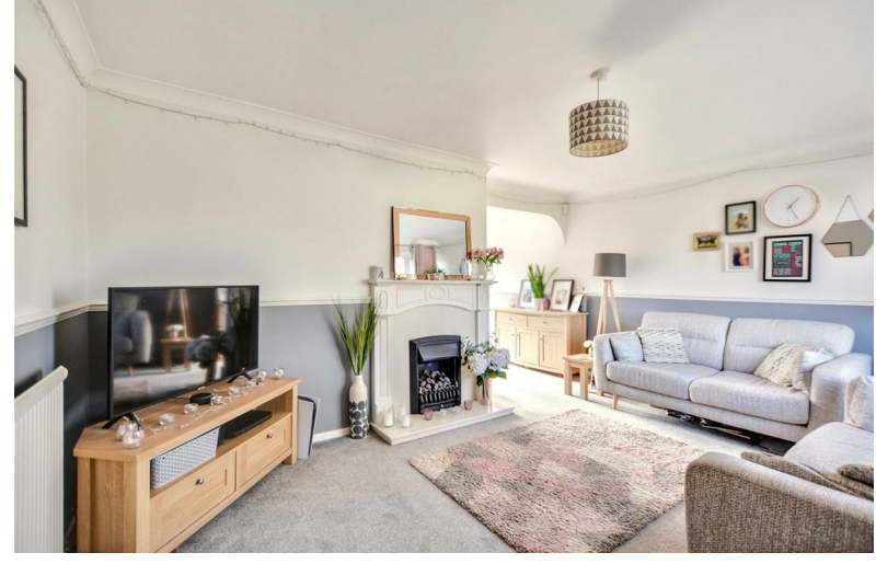
Sheridan Court Stapleford, Nottingham NG9 8LY