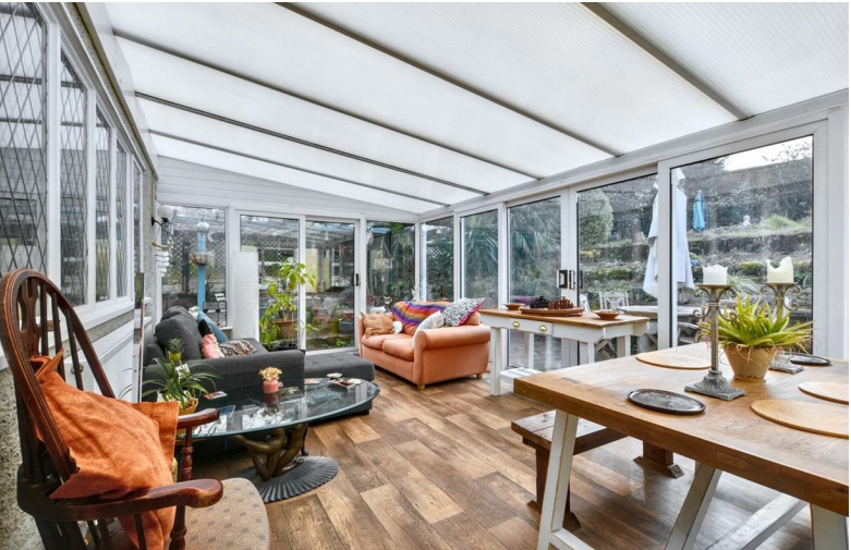
The Old Post Office, The Village, West Hallam, Derbyshire DE7 6GR

DETACHED COTTAGE SITUATED IN THE HEART OF THIS DESIRABLE DERBYSHIRE VILLAGE.