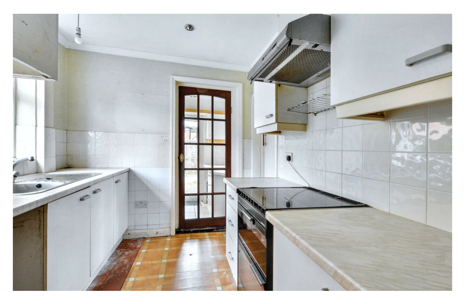
THIS IS A TRADITIONAL THREE BEDROOM BAY FRONTED SEMI DETACHED HOUSE WHICH IS NOW IN NEED OF A GENERAL UPGRADE PROGRAMME.

Being located on Park Street which is close to the heart of Breaston village, this traditional semi detached property is being sold with the benefit of NO UPWARD CHAIN, but now needs a general upgrade programme being carried out by a new owner. For the size and layout of the accommodation and potential of the property to be appreciated, we recommend that interested parties take a full inspection so they can see all that is included in the property for themselves. The property is well placed for easy access to the centre of Breaston village where there are a number of local shops, pubs and other amenities and to excellent transport links, all of which have helped to make this a very popular and convenient place to live.