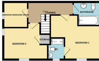
TOTAL FLOOR AREA: 924 sq.ft. (85.9 sq.m.) approx.

Whilst every attempt has been made to ensure the accuracy of the floorplan contained here, measurements of blocks, windows, rooms and any other items are approximate and no responsibility is taken for any error, omission or mis-statement. This plan is for illustrative purposes only and should be used as such by any prospective purchaser. The services, systems and appliances shown have not been tested and no guarantee as to their operability or efficiency can be given. Made with Hectopix 05022