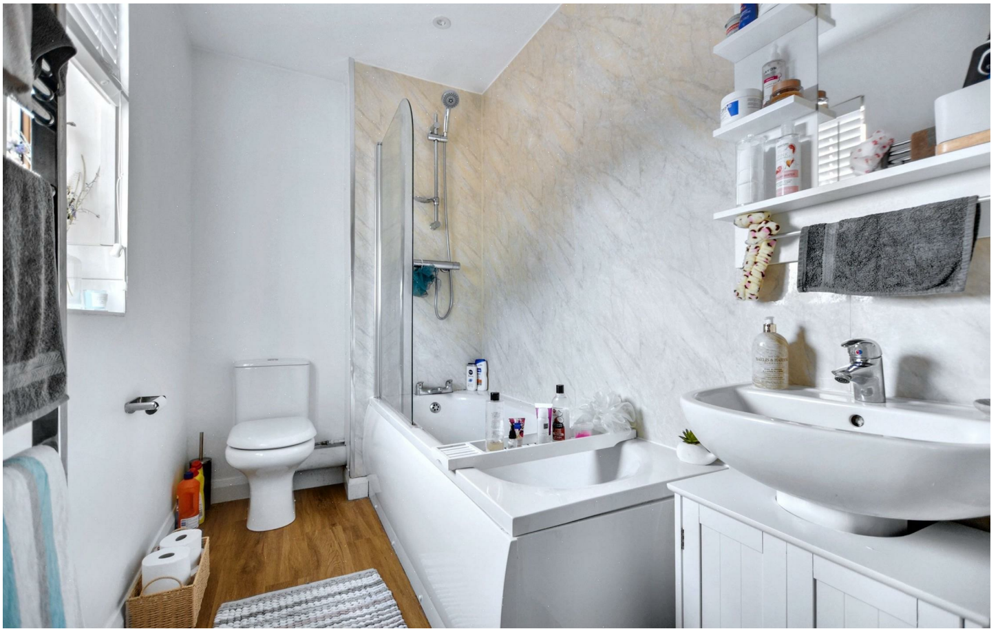
A CONTEMPORARY SECOND FLOOR APARTMENT PROVIDING TWO DOUBLE BEDROOMS AND OPEN PLAN LIVING AREA, BEING SOLD WITH NO UPWARD CHAIN.

Robert Ellis are pleased to bring to the market this well presented modern two bedroom second floor apartment. The apartment is located in a popular gated complex within walking distance of Long Eaton town centre and all the amenities on offer and has the benefit of an allocated car parking space. The apartment itself is of a modern construction, with a large open plan kitchen living dining area and is ideal for a first time buyer or buy to let investor looking for a property with a good potential rental return. The property also has the benefit of being available for sale with no upward chain.