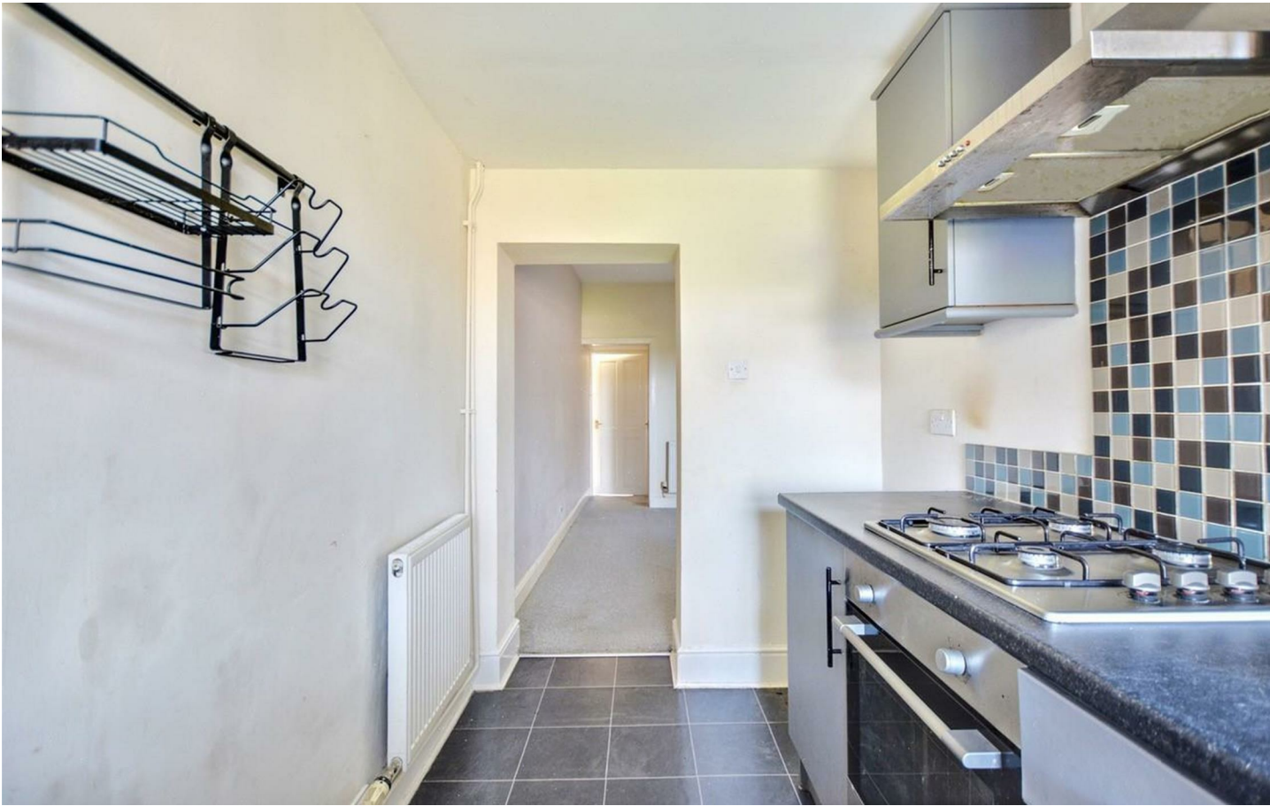
A surprisingly spacious two double bedroom mid terraced house.

What sets this property apart from many similar houses is the generously proportioned rear garden with patio and lawn, a great safe space for kids and for entertaining in the Summer months.