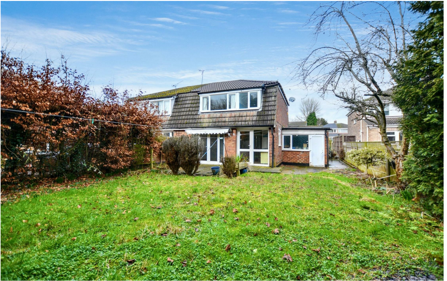
A THREE BEDROOM SEMI DETACHED HOUSE IN NEED OF UPGRADING.

Robert Ellis are delighted to offer to the market this semi detached home found on Netherfield Road. The property offers a fantastic opportunity for a purchaser to make this home their own as the property requires upgrading throughout. Found within a popular residential location and within the catchment of Friesland School, there is also great access to a variety of local shops and amenities as well as town centres in Sandiacre and Long Eaton. The property is also ideally positioned for the M1 and A52 for commuters and has the huge bonus of being offered for sale with NO UPWARD CHAIN.