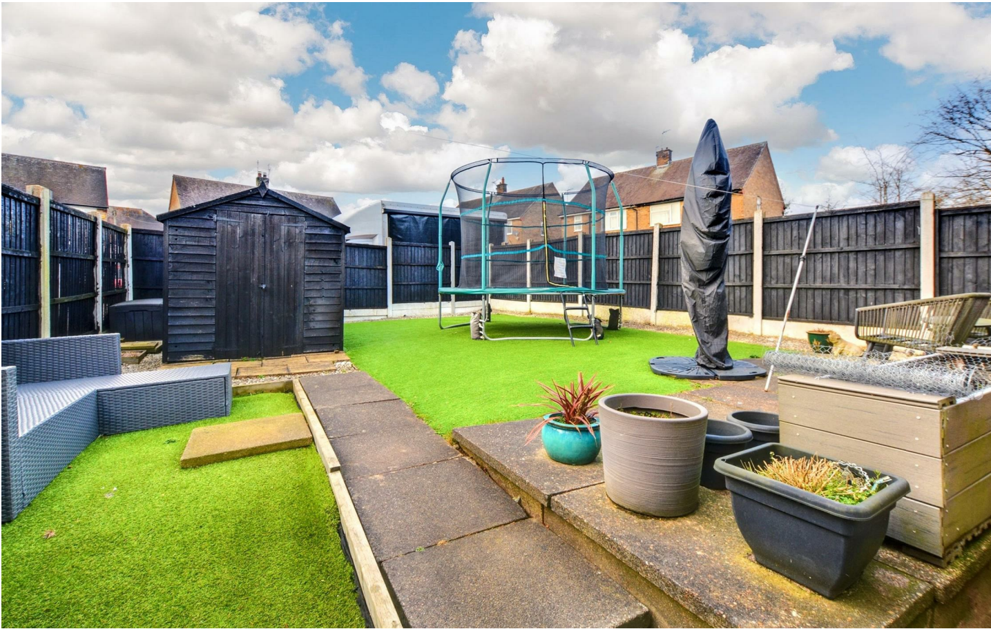
This charming 3-bedroom semi-detached house, located in the sought-after area of Hucknall, Nottingham, offers a perfect opportunity for families or first-time buyers. The ground floor comprises a spacious lounge/diner, creating a welcoming open-plan living space ideal for relaxation and entertaining, alongside a functional kitchen. Upstairs, you'll find three well-proportioned bedrooms and a family bathroom. Outside, the property benefits from a driveway with space for multiple vehicles to the front, while the rear garden provides a private outdoor area for enjoyment. With excellent potential and a prime location close to local amenities, schools, and transport links, this property is an ideal choice for anyone looking to make a home in a friendly and well-connected neighbourhood.