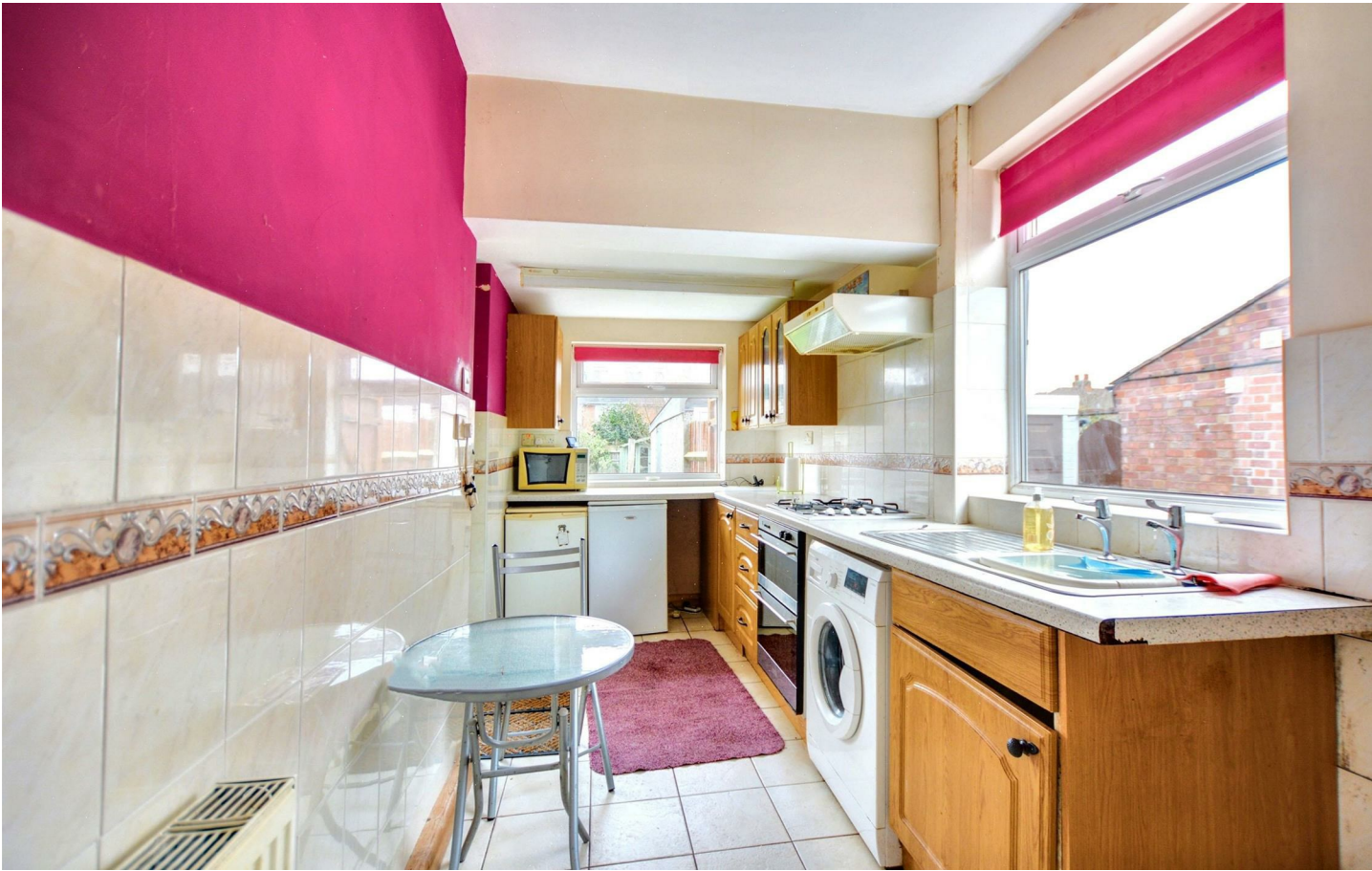
A three-bedroom semi-detached house with a garage.

Situated in this popular and convenient residential location, just a short distance away from a variety of local shops and amenities, including schools, transport links, and Beeston Town Centre, this fantastic property is considered an ideal opportunity for a range of potential purchasers including first time buyers, young professionals and families.