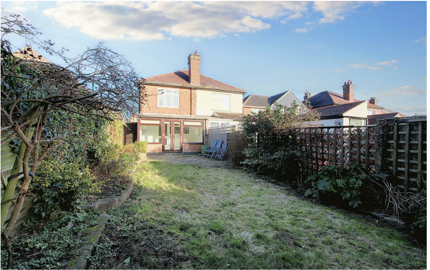
A WELL PRESENTED, BAY FRONTED, THREE BEDROOM SEMI-DETACHED HOUSE WITH ENCLOSED REAR GARDEN.

Robert Ellis are delighted to market this well presented, spacious three bedroom semi-detached family home. The property is constructed of brick and benefits from double glazing and new gas central heating throughout and would ideally suit a range of buyers including first time buyers, the growing family, people looking to downsize and investors alike as there is currently a sitting tenant living in the property. An internal viewing is essential to appreciate the property and location on offer.