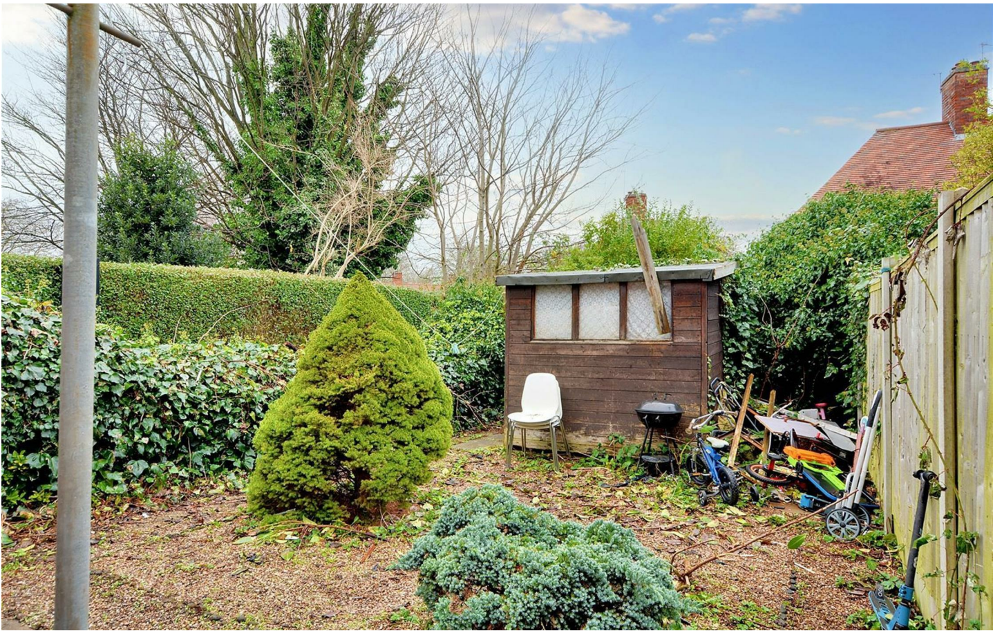
A three-bedroom end-terrace house.

Situated in this popular and convenient residential location, just a short distance from a range of local shops and amenities including schools, transport links, The University of Nottingham and Queens Medical Centre, this fantastic property is considered an ideal opportunity for a variety of potential purchasers including first time buyers, young professionals, families, and investors.