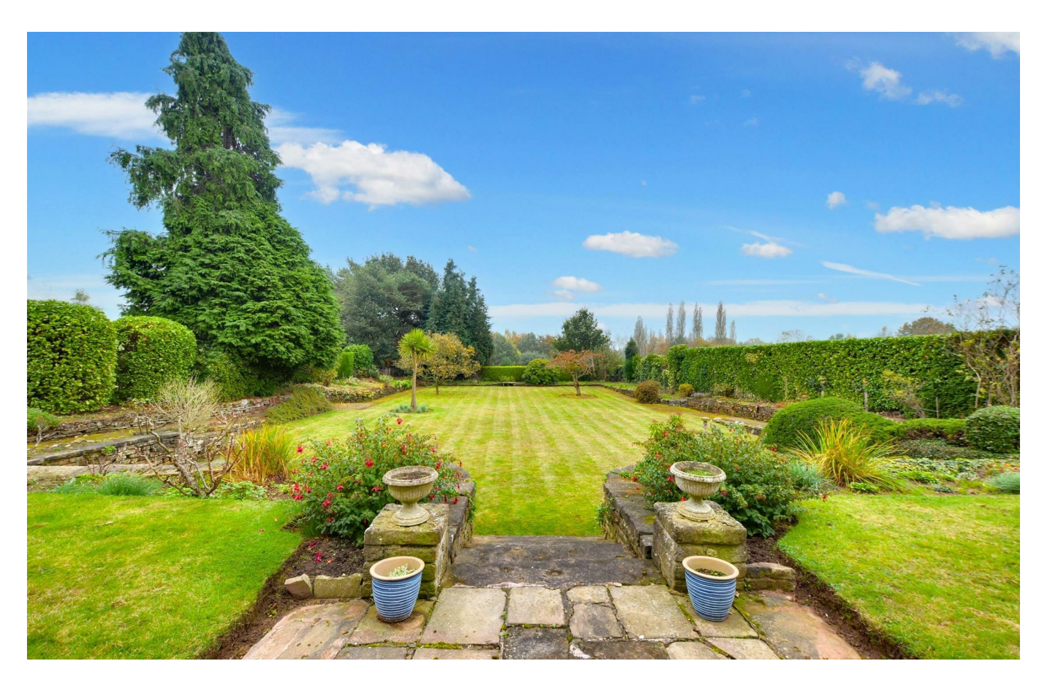
A BEAUTIFUL, UNIQUE DETACHED FIVE BEDROOM PROPERTY WHICH HAS STUNNING VIEWS OF BEESTON FIELDS GOLF COURSE AND PROVIDES A NEW OWNER WITH THE OPPORTUNITY TO RENOVATE THE EXISTING PROPERTY OR BUILD A NEW HOME.

Robert Ellis are pleased to be instructed to market this unique detached property which is situated on Beeston Fields Drive - one of the most prestigious roads in Nottinghamshire. The property benefits from being on a plot which is approx ½ acre in size and overlooks Beeston Fields golf course and now provides the opportunity for a new owner to alter and extend the property or to build a new home. The property is larger than people expect it to be from a quick look at the front, so we do recommend that interested parties take a full inspection to see the generous size of the accommodation and the extent of the beautiful South facing gardens at the rear for themselves. Beeston Fields Drive is well placed for easy access to Nottingham city centre and the university, Queens Medical Centre and Boots and is also only a few minutes drive away from the M1, all of which have helped to make this a very popular and convenient location.