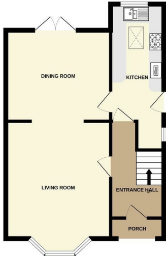
GROUND FLOOR 512 sq.ft. (47.6 sq.m.) approx.