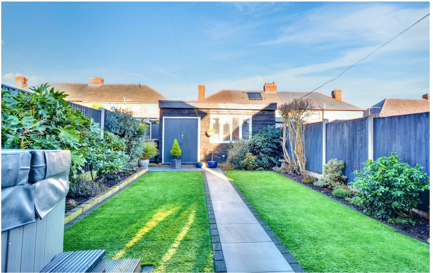
A BAY FRONTED THREE BEDROOM SEMI DETACHED HOUSE.

Robert Ellis are delighted to welcome to the market this extremely well presented, bay fronted three bedroom semi detached house situated within this popular and established residential location.