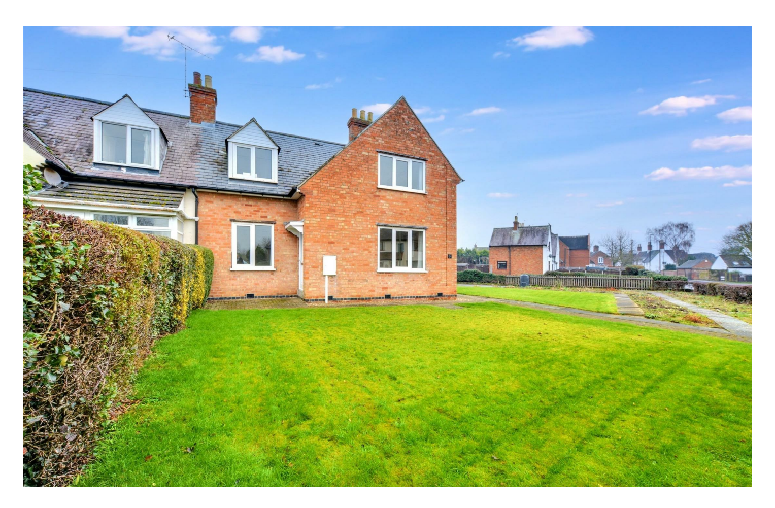
EXCITING DEVELOPMENT OPPORTUNITY IN THE HEART OF SOUGHT AFTER ASTON ON TRENT, A TRADITIONAL THREE BEDROOM SEMI DETACHED HOUSE ON A LARGE CORNER PLOT BEING SOLD WITH NO UPWARD CHAIN WITH POTENTIAL TO EXTEND WITH PLANNING PERMISSION.

An exciting opportunity to purchase this traditional house in the heart of Aston on Trent situated on a substantial comer plot with gardens to the front, side and rear with a brick built detached garage and large driveway. The property is being sold with the benefit of NO UPWARD CHAIN and for the size of the spacious accommodation and potential to be appreciated, we recommend that interested parties do take a full inspection so they can see all that is included in this lovely home for themselves. With uPVC double glazing throughout and gas central heating, the property is ready to move straight into. The property could easily be extended to the side, subject to planning and would provide an ideal opportunity to create additional bedroom, reception room and bathroom space. The property is perfectly placed within Aston on Trent for easy access to all the amenities and facilities provided by the area and it is close to excellent transport links, all of which has helped to make this a very popular and convenient place to live.