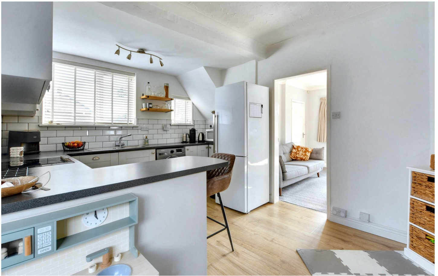
A modern three-bedroom, semi-detached property in a sought-after and established residential location.

Situated just a short walk from Wollaton Hall and Deer Park, you are in a fantastic position with a wealth of local amenities on your doorstep. This includes shops, public houses, transport links and schools, particularly the desirable Fernwood School, both primarily and secondary.