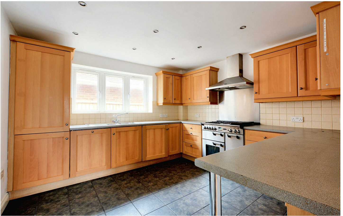
An individual two-bedroom detached house.

Offering a spacious and versatile interior with bedrooms to both ground and first floor level, this unique house, has been remodelled for those with mobility issues, though could easily be adapted to suit a range of potential purchasers.