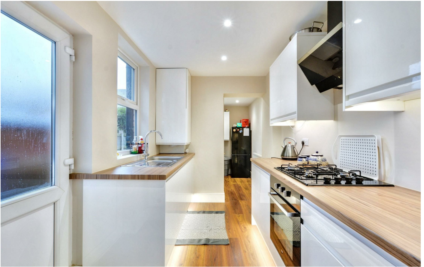
A period two double bedroom semi detached house.

Behind this traditional facade lies a modern, contemporary home, recently refurbished and ready to move into. Features include gas fired central heating served from a combination boiler, double glazed windows and newly fitted kitchen. The property also enjoys a contemporary first floor four piece bathroom.