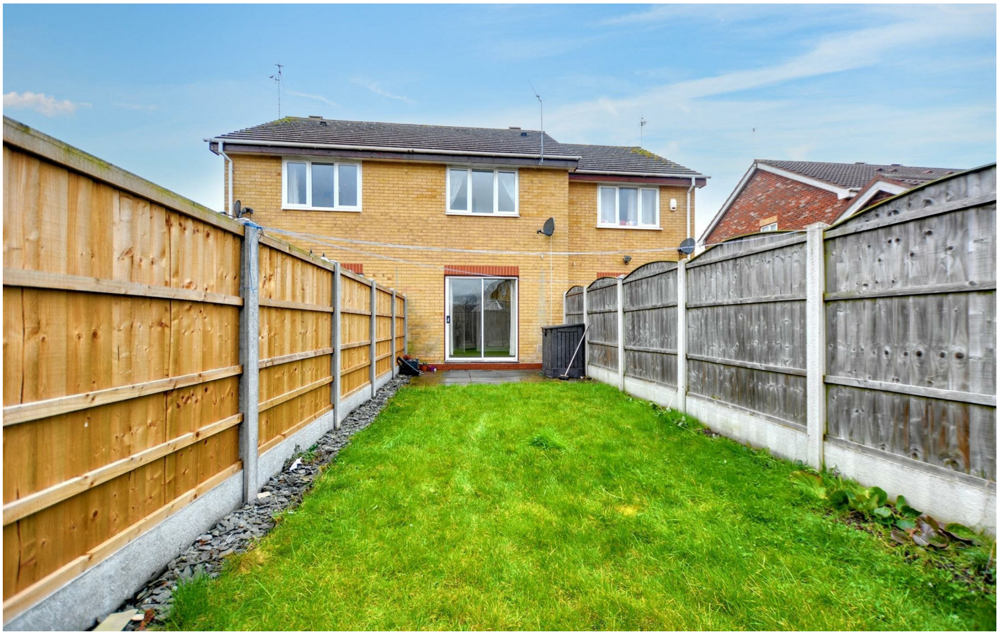
A TWO BEDROOM MID PROPERTY WITH OFF ROAD PARKING TO THE FRONT.

Robert Ellis are pleased to offer to the market, this mid terraced property set within this popular part of Long Eaton. The property is located just a stones throw from a variety of local shops and amenities as well as being ideally positioned for Long Eaton train station. There are also some desirable places within close distance to walk and enjoy such as West Park or the canal which will in turn lead you to the town centre. The properties positioning also provides great access to the A50, M1 and East Midlands Airport.