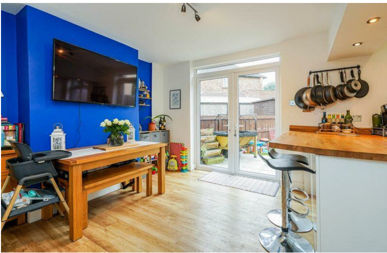
Westdale Lane Carlton, Nottingham NG4 3JU