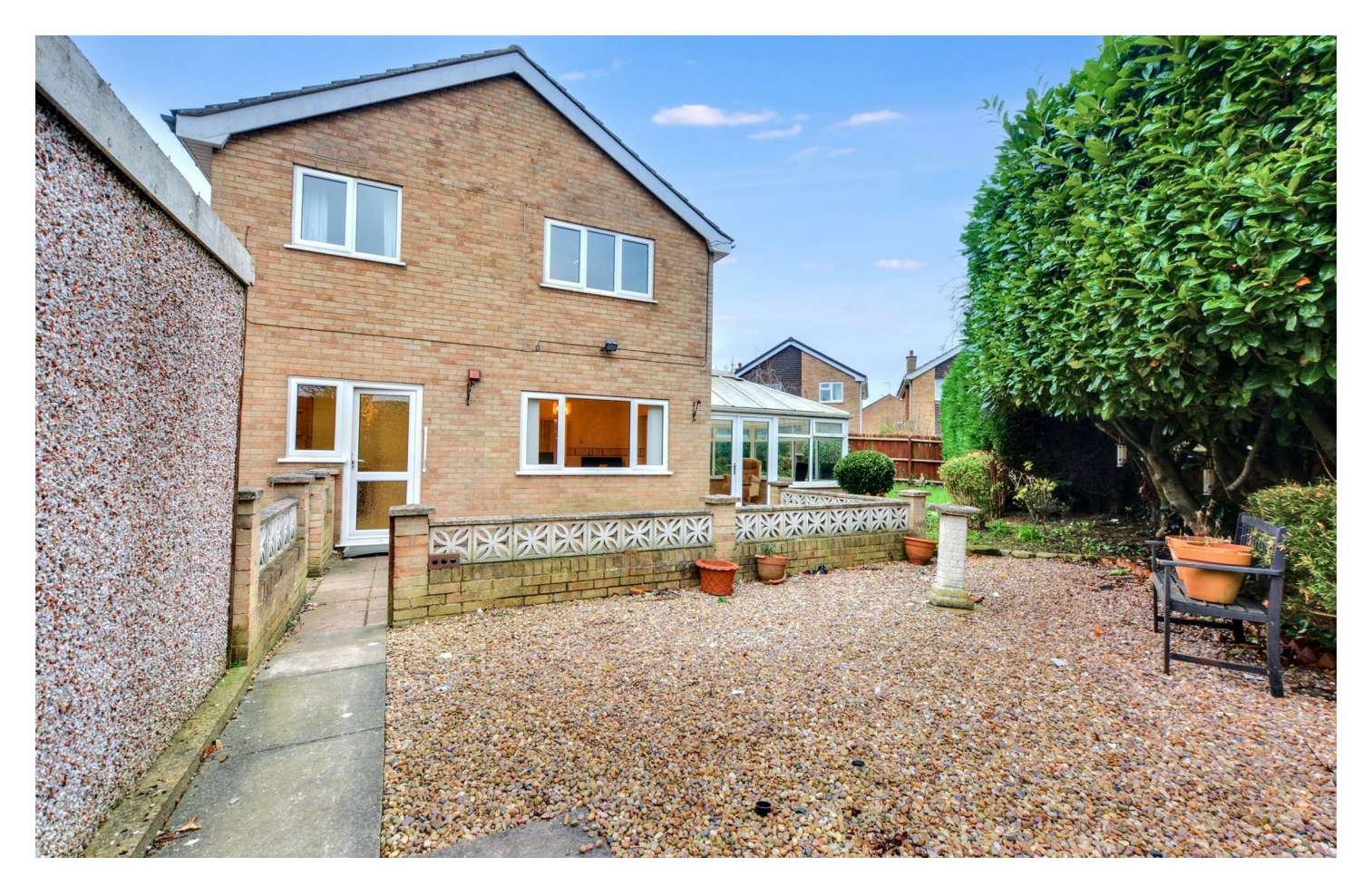
THIS IS A GABLE FRONTED, FOUR BEDROOM DETACHED HOUSE NOW IN NEED OF UPDATING, WHICH IS SITUATED ON A QUIET CUL-DE-SAC IN THIS POPULAR RESIDENTIAL AREA.

Being situated on Teesdale Road, this four bedroom detached home provides the ideal opportunity for a new owner to stamp their own mark on their next property. The property is being sold with the benefit of NO UPWARD CHAIN and is ready to move into and to appreciate the size and layout of the accommodation and the privacy of the gardens to be appreciated we recommend that interested parties do take a full inspection so that they can see all that is included for themselves. The property is well placed for easy access to excellent local schools and all the amenities and facilities provided by Long Eaton and the surrounding area and to excellent transport links, all of which has helped to make this a very popular and convenient place to live.