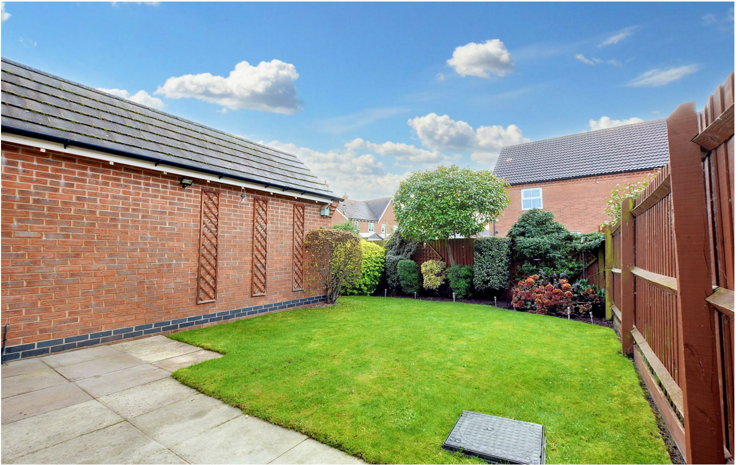
A THREE BEDROOM SEMI DETACHED HOUSE WITH OFF ROAD PARKING AND A GARAGE.

Robert Ellis are pleased to bring to the market this beautiful semi detached home on Circuit Drive. Built in 2013, this modern home is ideally presented for anyone looking to move straight into a property and enjoy their new surroundings immediately. The property offers a great size lounge which has a door that leads into the kitchen diner. The kitchen diner is a great space for cooking whilst also being a social spot for entertaining guests as the French doors open onto the fully enclosed rear garden. The property is ideally positioned for shops and amenities as well as being positioned in a great spot for local schools and access to Long Eaton Town Centre and also Toton, which provides a tram to Nottingham City Centre.