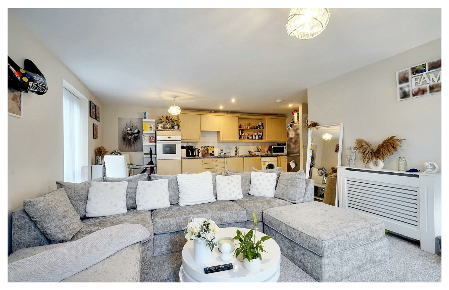
THIS IS A SPACIOUS GROUND FLOOR APARTMENT WHICH IS PART OF A PURPOSE BUILT DEVELOPMENT SITUATED ON THE EDGE OF LONG EATON TOWN CENTRE.

Being located on Acton Road, Bradmore House is a purpose built apartment block which are well placed for easy access to all the amenities and facilities provided by Long Eaton and the surrounding area. The apartment offers light and airy accommodation and for the size of the bedrooms and living space included to be appreciated we recommend that interested parties do take a full inspection so they are able to see all that is included in the property for themselves. The property would suit a first time buyer, somebody downsizing from a larger property or a landlord who is looking for a property that would be easy to rent.