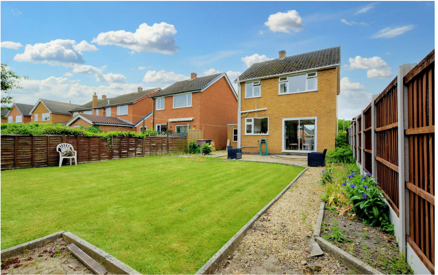
THIS IS A GABLE FRONTED DETACHED PROPERTY SITUATED ON THE LARGEST PLOT IN THE IMMEDIATE AREA.

Being located on Milner Avenue, this detached property offers a lovely family home which provides the opportunity for a new owner to extend, if this was something they would like to carry out in the future to enlarge both the ground and first floor accommodation. The property is ready for immediate occupation and for the size of the accommodation and the plot to be appreciated, we recommend that interested parties do take a full inspection so they can see the whole property for themselves. The property is situated close to the centre of this award winning village where there are local shops and schools for younger children, whilst more shopping facilities can be found in the adjacent villages of Borrowwash and Breaston as well as Long Eaton, which is only a short drive away.