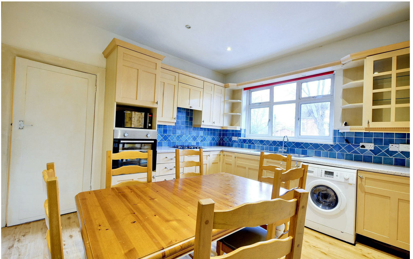
A spacious three-bedroom duplex.

Situated in this sought-after and well established residential location, within close proximity to a range of local shops and amenities including schools, transport links, and Beeston Town Centre, this fantastic property is considered an ideal opportunity for a variety of potential purchasers including first time buyers, young professionals, and investors.