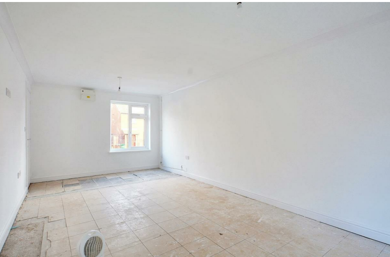
Fenton Road Basford, Nottingham NG5 ILY