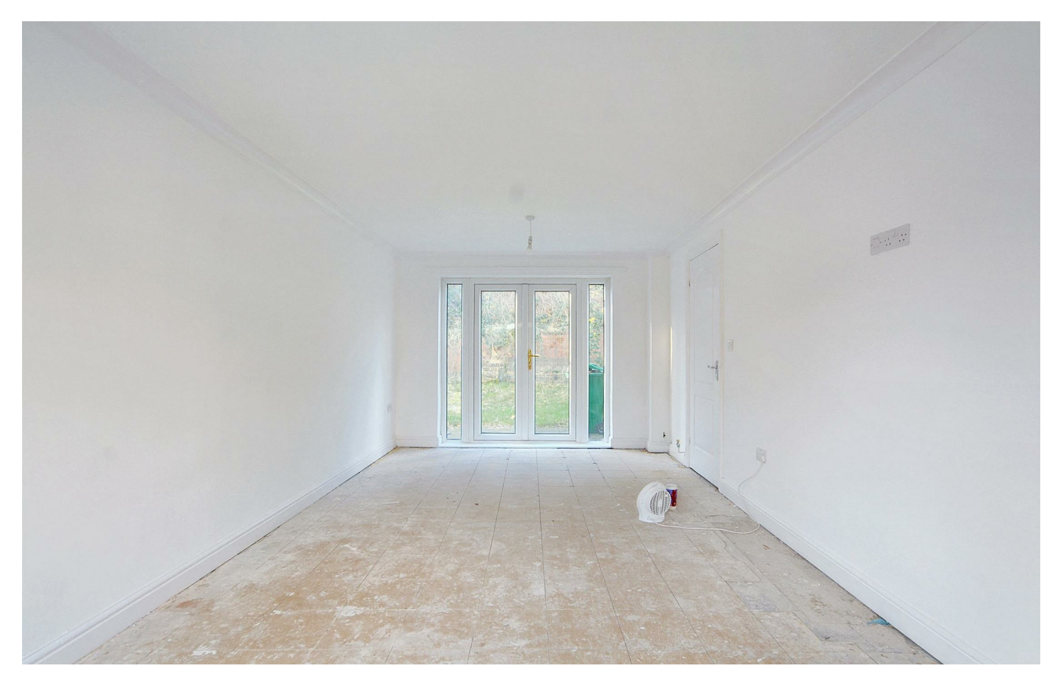
***Guide price £250,000 - £265,000***