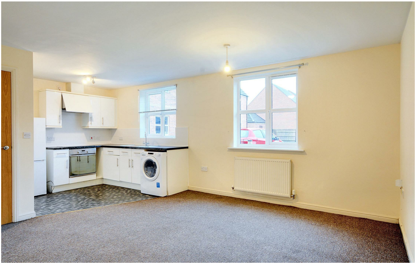
A two-bedroom ground floor flat.

Situated in this popular and convenient residential location, readily accessible for a variety of local shops and amenities including transport links, Chilwell retail park, and Attenborough Nature Reserve, this fantastic property is considered an ideal opportunity for a range of potential purchasers including first time buyers, young professionals, and investors.