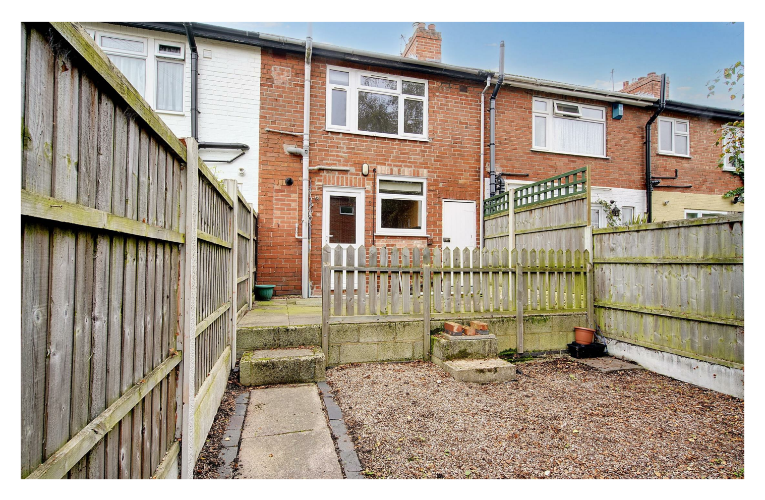
THIS IS A TWO DOUBLE BEDROOM PROPERTY WHICH HAS BEEN WELL MAINTAINED AND IS NOW READY FOR IMMEDIATE OCCUPATION.

Being located on New Tythe Street which is a road on the outskirts of Long Eaton, this two double bedroom mid property offers a lovely home which will suit a whole range of buyers, from people buying their first property to those who might be downsizing, or somebody who might be looking for a property which would be easy to rent. The property is currently empty and is therefore being sold with the benefit of NO UPWARD CHAIN and for the size and layout of the accommodation and privacy of the rear garden to be appreciated, we recommend that interested parties should take a full inspection so they can see all that is included in the property for themselves. The house is located within a few minutes walk of Long Eaton town centre and to the many other facilities and amenities provided by the surrounding area.