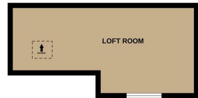
1ST FLOOR 192 sq.ft. (17.8 sq.m.) approx.