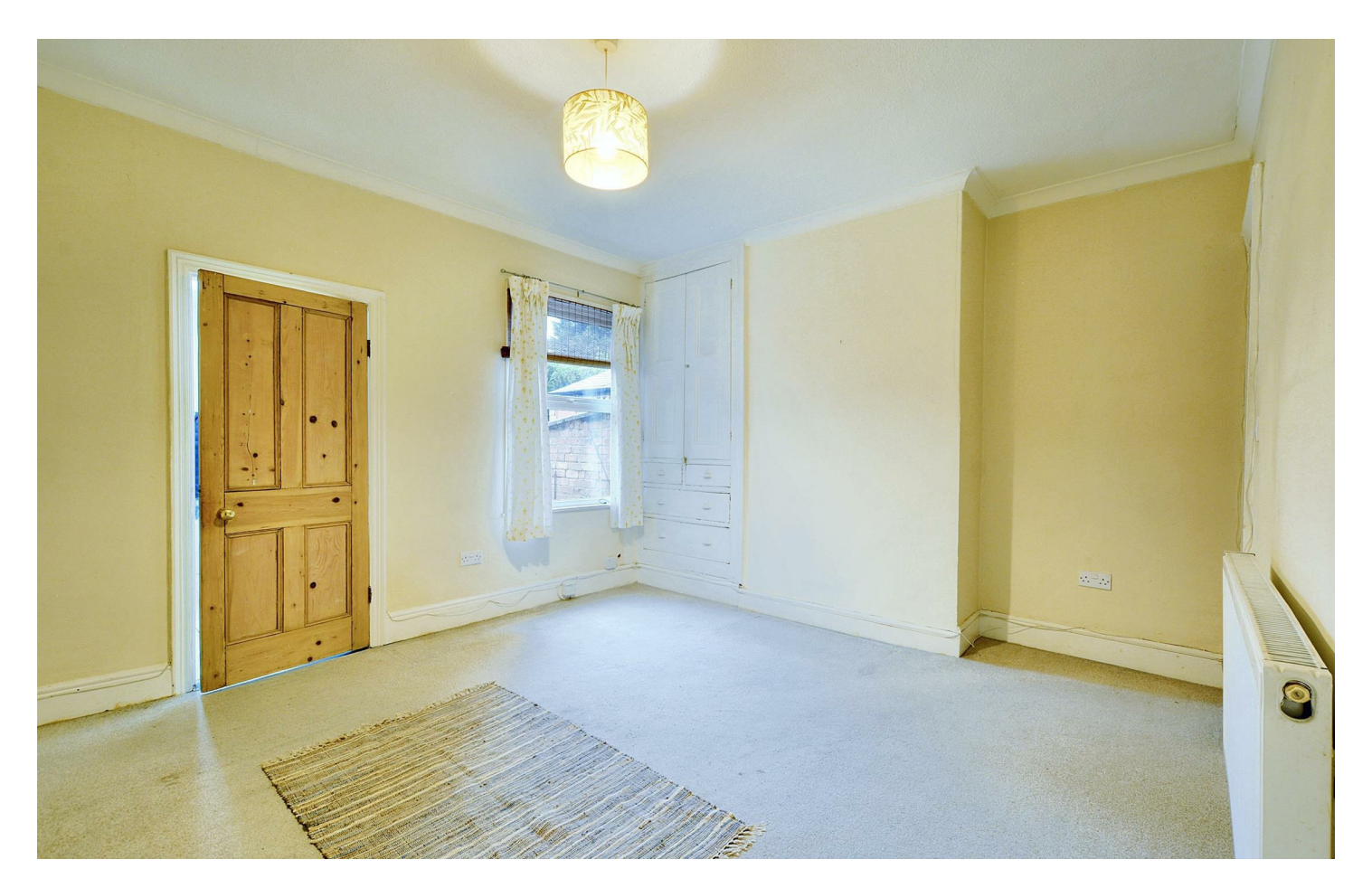
Robert Ellis Estate Agents are delighted to present this charming TWO-BEDROOM MID-TERRACE FAMILY HOME, ideally positioned in the heart of Daybrook, Nottingham.

Perfectly located, this property is within close proximity to Nottingham City Hospital and Arnold Town Centre, offering a variety of local amenities, shops, and restaurants. For added convenience, there are excellent transport links to Mapperley, Nottingham City Centre, and surrounding areas. Families will appreciate the nearby schooling options, including Redhill Academy, Arnbrook, and Arnold Mill Primary School.