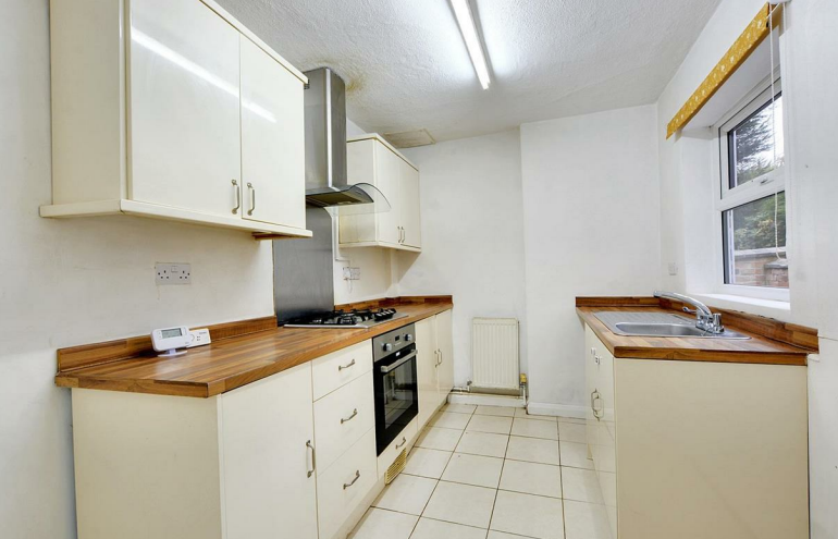
Edwin Street Daybrook, Nottingham NG5 6AX