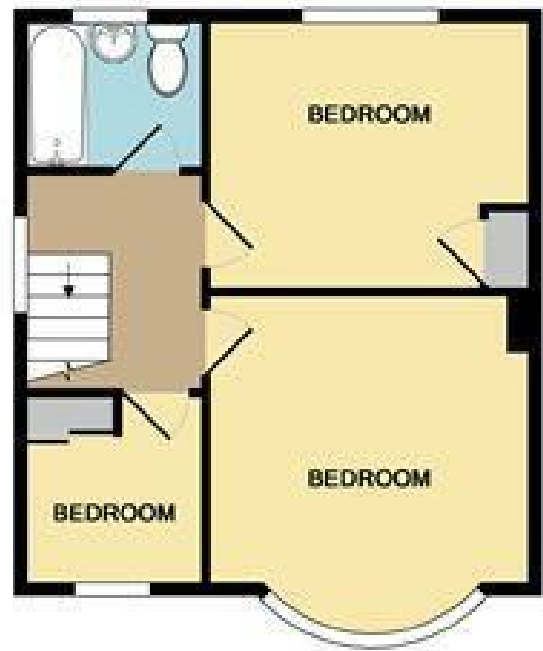
1ST FLOOR APPROX. FLOOR AREA 385 SQ.FT. (35.8 SQ.M.)