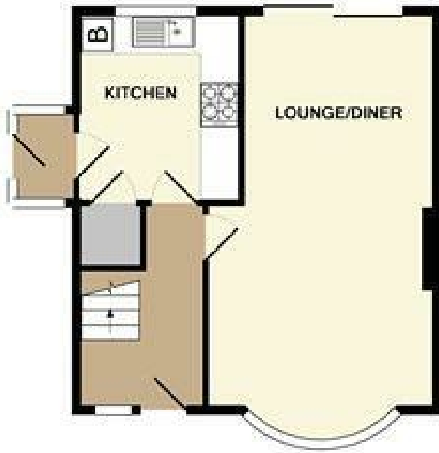
GROUND FLOOR APPROX. FLOOR AREA 401 SQ.FT. (37.3 SQ.M.)