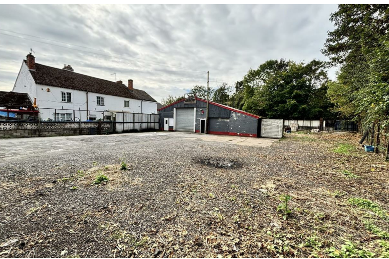
4 Brookhill Leys Road New Eastwood, Nottingham NG16 3HZ